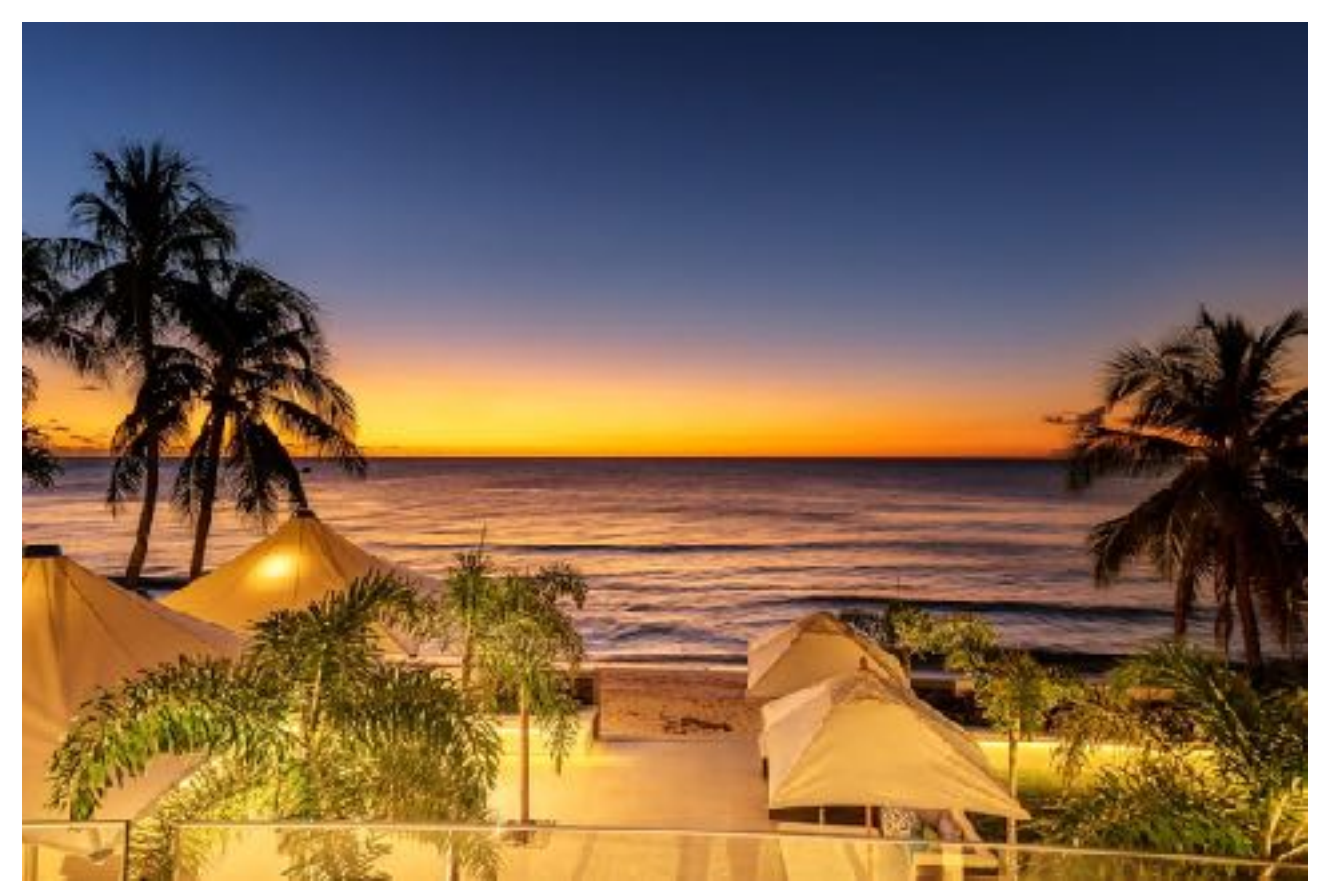
In Barbados, luxury isn't just a concept; it's a lifestyle. The villas embody this mantra, providing you with a personalized experience tailored to

These villas are more than just holiday rentals; they're your home away from home, enveloped in the beauty and tranquility of the island. Each villa is unique in design, boasting a blend of traditional Bajan architecture and modern luxury, creating a harmonious balance that complements the island's natural beauty. Whether you're seeking a peaceful getaway or a vibrant holiday, these villas offer the perfect setting for an unforgettable stay.