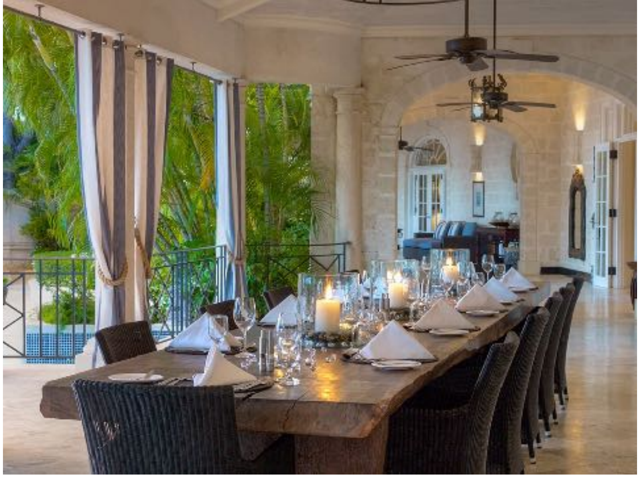
Cove Spring House